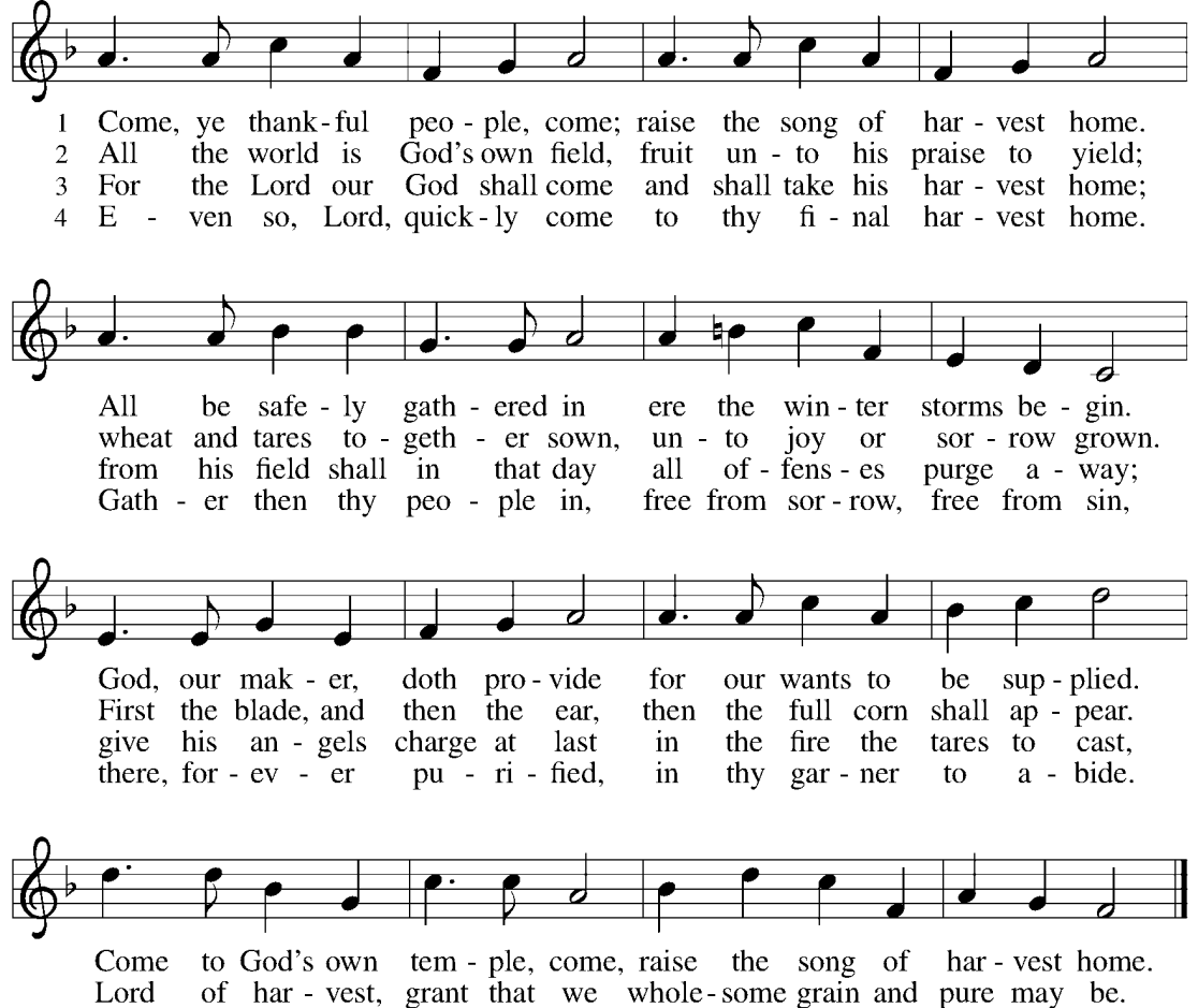
We stand. HYMN OF THE DAY : Come, Ye Thankful People, Come

Lord of har - vest, grant that we whole - some grain and pure may be. but the fruit - ful ears to store in his gar - ner ev - er - more. Come, with all thine an - gels, come, raise the glo - rious har - vest home!