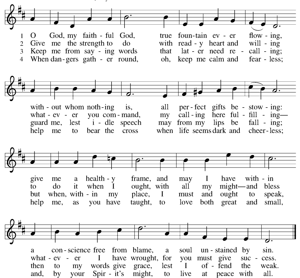
We stand. HYMN OF THE DAY: O God, My Faithful God